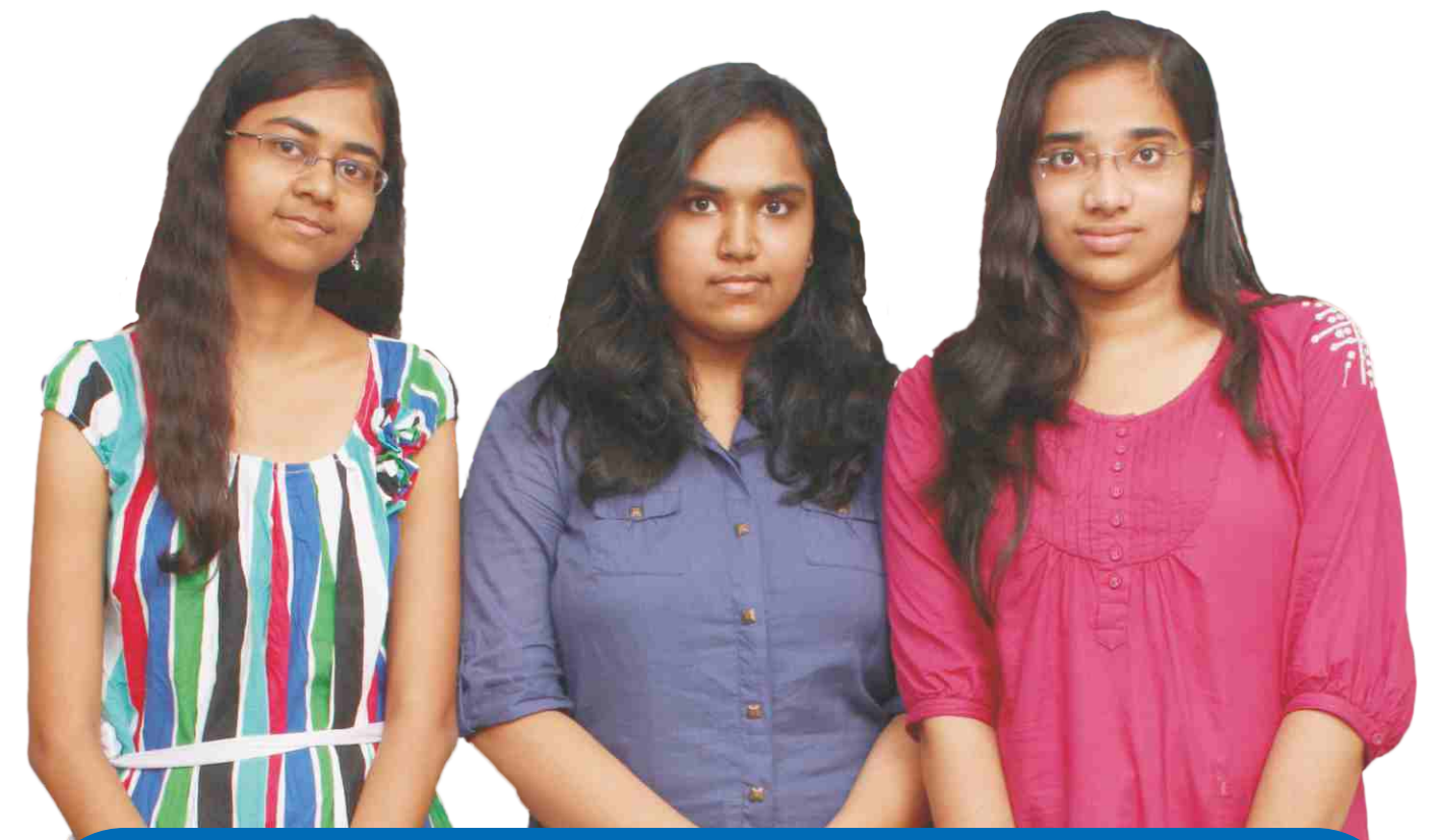
OUR 3 ALL INDIA RANKERS AT CPT JUNE'12